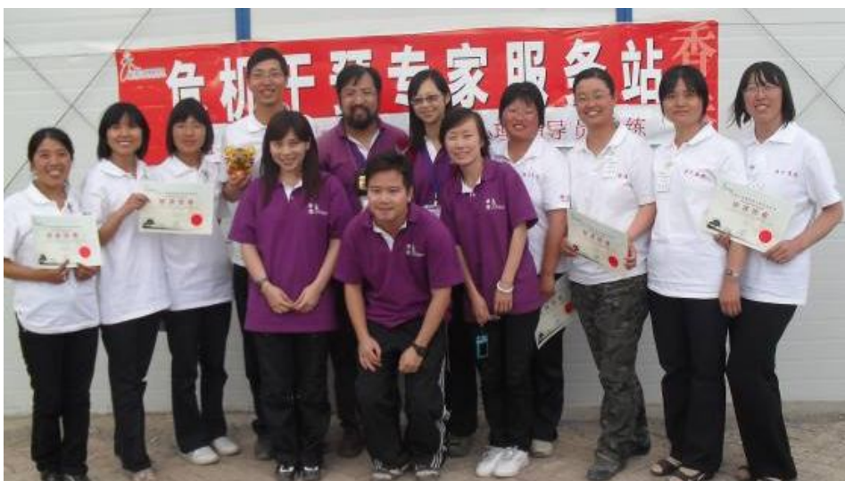
Sisters were awarded certificates after training

Capacity building: NLP Psychological Training for Yushu Serving Sisters From July 31 to August 2, sisters in Yushu Station took part in a psychological training organized by Hong Kong Post-Disaster Counseling Association; this training aims to help those volunteers who have been serving in Yushu for more than three months improve and strengthen their professional skill which could be in return put into practice more efficiently.