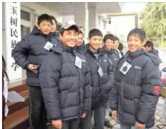
Students are trying on the new winter coats