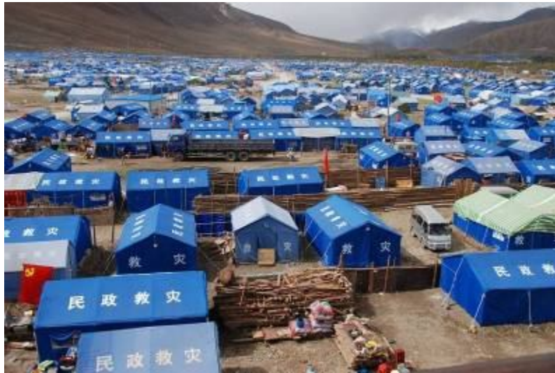
Saima Camp, survivor's tents

construction work has been forced to stop so most of the people have to spend the cold winter in their tents.