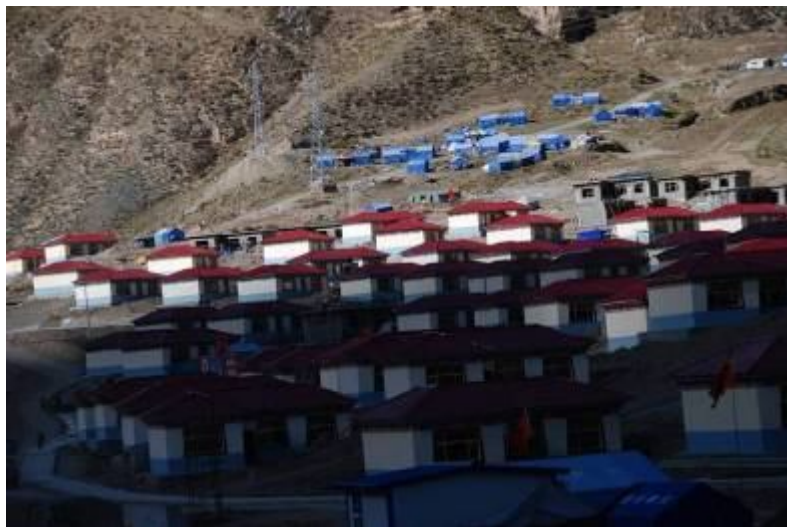
New permanent houses