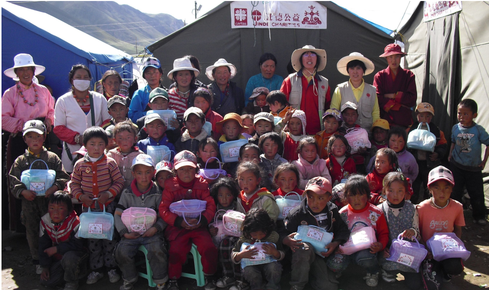
Participants of hygiene class in Saima Camp, May 2010