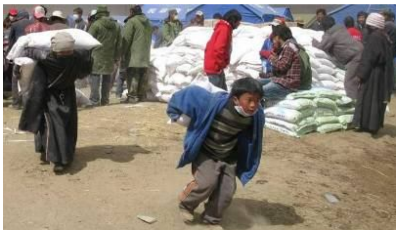
Flour distribution, Saima Camp, April 20, 2010