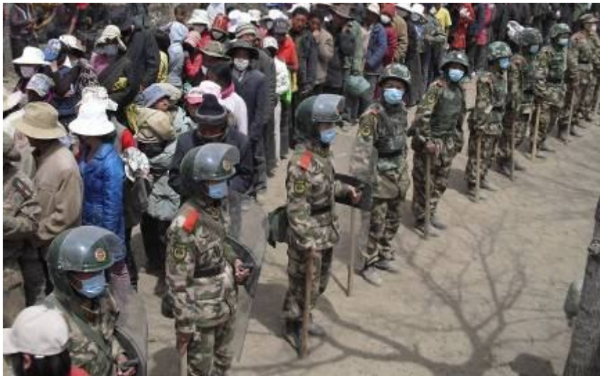
Police helped to maintain the order during distribution, May 2010.

There was only one occasion where safety became an issue. In this case, the military provided support during the distribution process. There were no incidents.