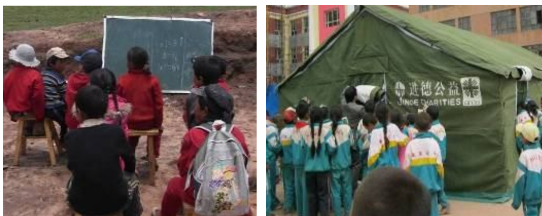
Nangqian County, Pre-and post-distribution 2010